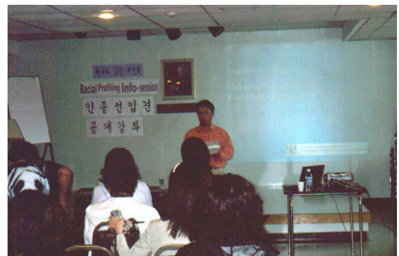
Open lecture about racial profiling