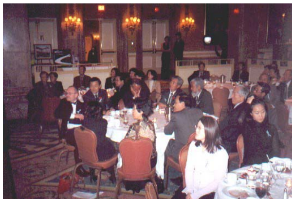
Fundraising Gala Dinner, November 7, 2003