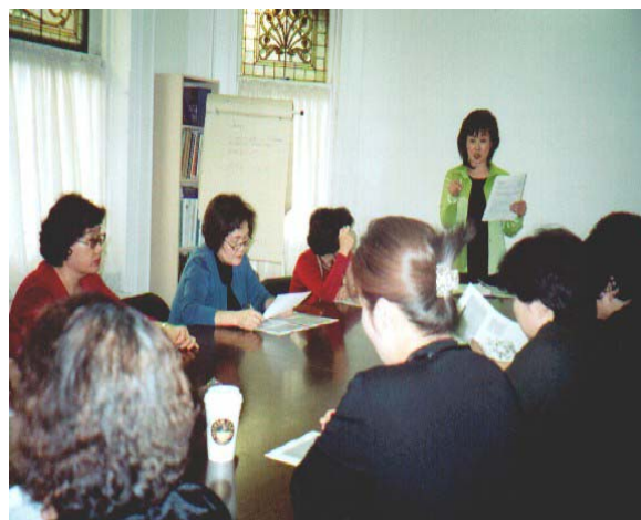
2003 Home Support Service Worker's Training